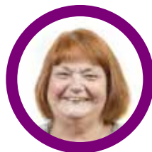
Cllr Christine Ludlow Cabinet Minister for Housing, Chesterfield Borough Council